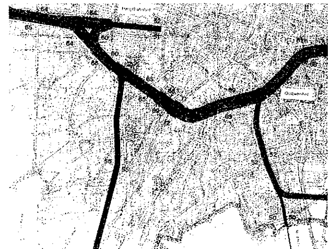
Figure 2: Noise situation along railway lines

This map shows noise immission levels for buildings next to the roads in classes of 5 dB(A), plotted as coloured stripes onto the corresponding main roads of the city map. With reference to the black/white picture above, areas of high noise levels are plotted darker than areas of lower noise pollution. Plotted stars indicate that no buildings exist beneath the road (therefore the emission noise level is plotted). All calculations have been done in accordance with the instruction RLS-90.